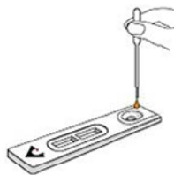
Apply sample to sample well